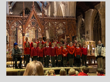
Choir enjoyed singing at St Wulfram's

This term we haven't been so fortunate and despite our best efforts have not been able to afford some of the experiences we would have liked for the children. Just like all of you, our bills are going up and up but as yet the government have not given us any more money and we have been unable to find the shortfall. We have done everything we can to ensure that despite not going out we have made our curriculum engaging and interesting for the children.